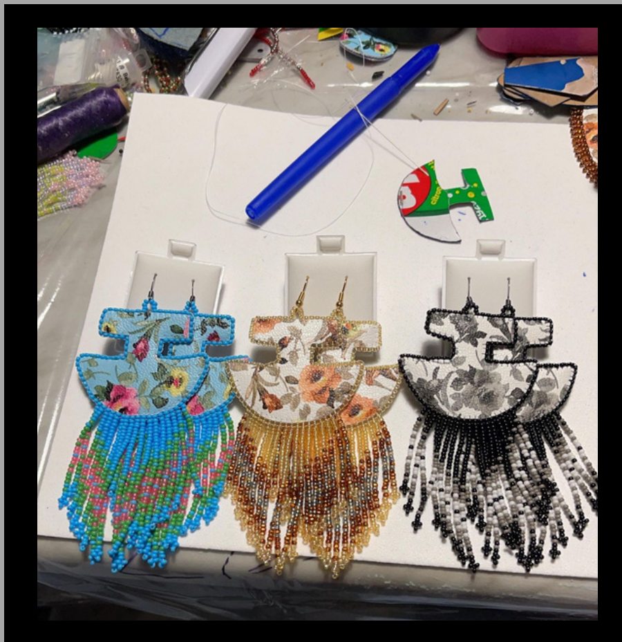
Uluk-shaped beaded earrings