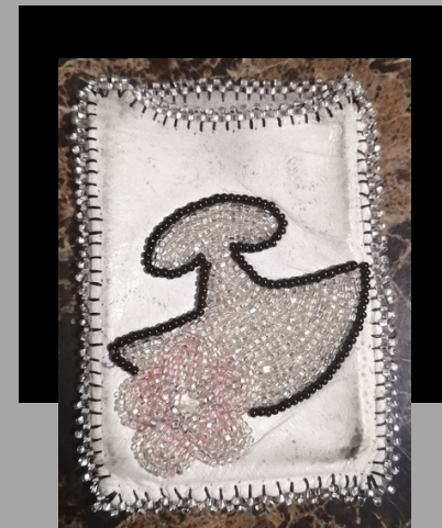
Cardholder with beaded uluk