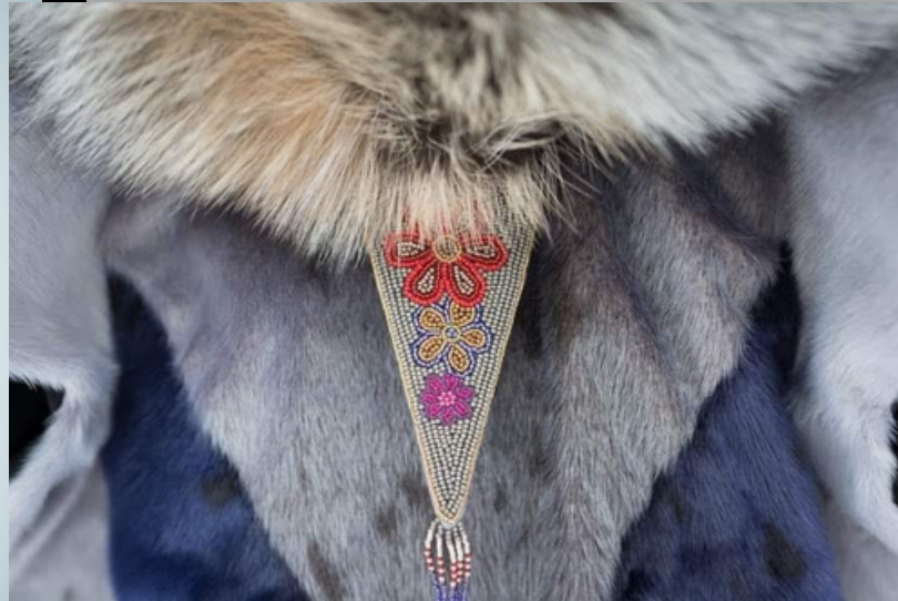
Sealskin arnautik with beading in collaboration with Beatrice Deer Designed for the INUA Exhibition of Qaumajuq at the WAG