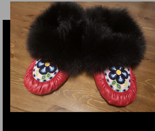
Slippers and pualuuk (mittens) with beadwork