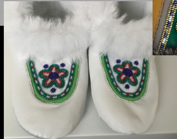
Slippers with beaded uppers (qalliniit)