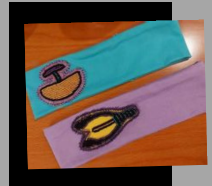
Headband with kakivak and beaded uluk