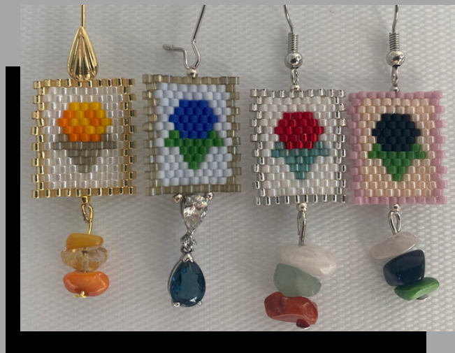
Earrings from the "Paurgnait/Berries" collection