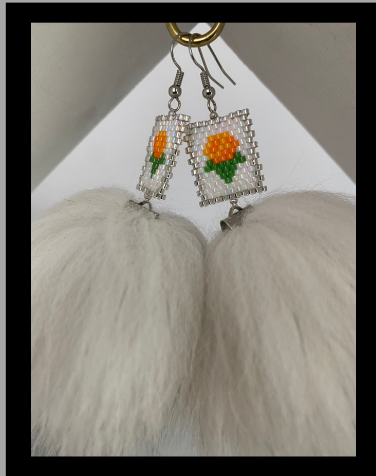
Beaded earrings with fur