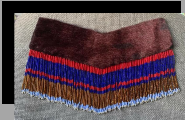
Beaded breastplate (savviguti) for amauti