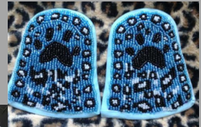
Beaded uppers (qalliniit)