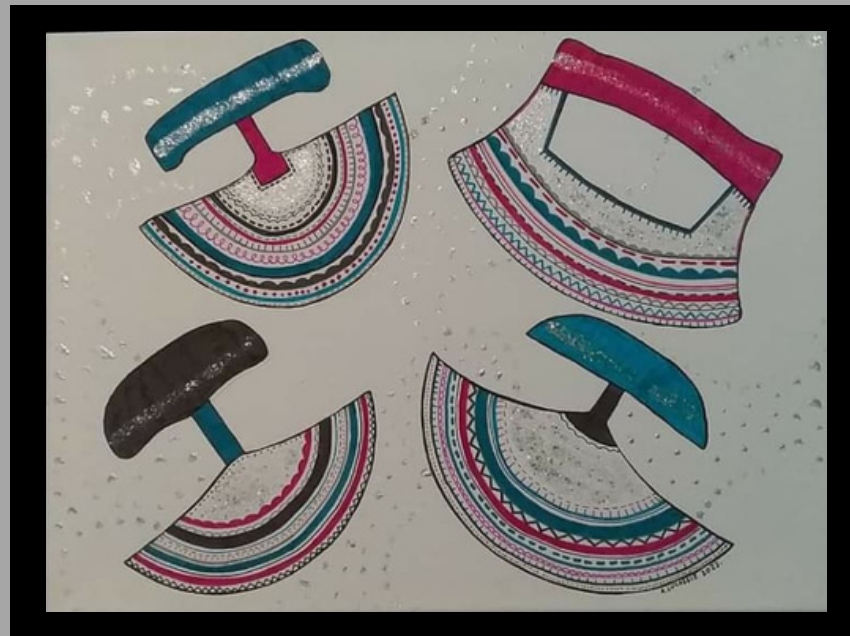
Uluit made with acrylic paint