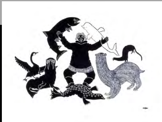
"Look What I See When I Have No Harpoon" 1973