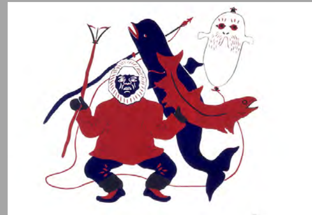
"The Hunter" 1973