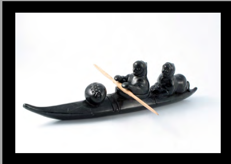
"Hunting by Kayak" 2005

"The interest in Inuit prints lies more with the subject rather than the technical skills of the printer. Not so with Thomassie Echalook . . . [his prints] show remarkable discipline and control of line" (Virginia Watt 1976:5).