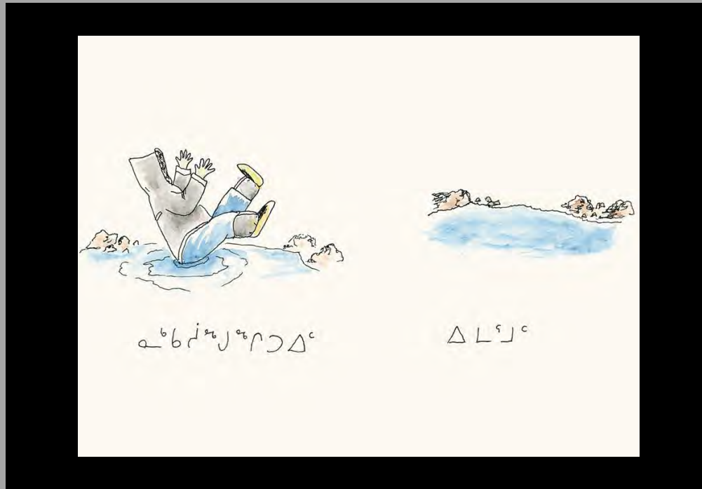
Pages from the book "Fish Have no Legs" 2009