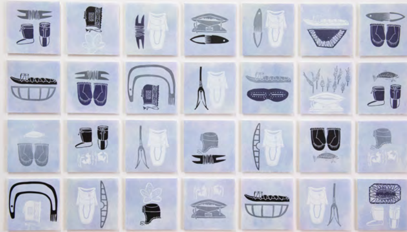
"Convergence North/South" 2017