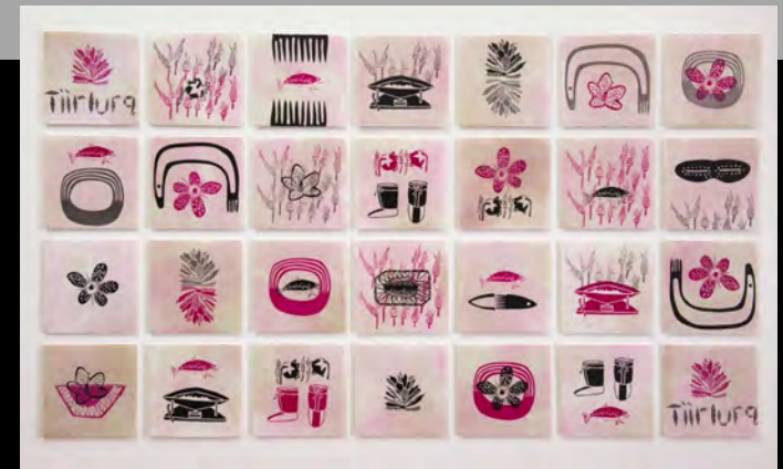
"Convergence North/South" 2017