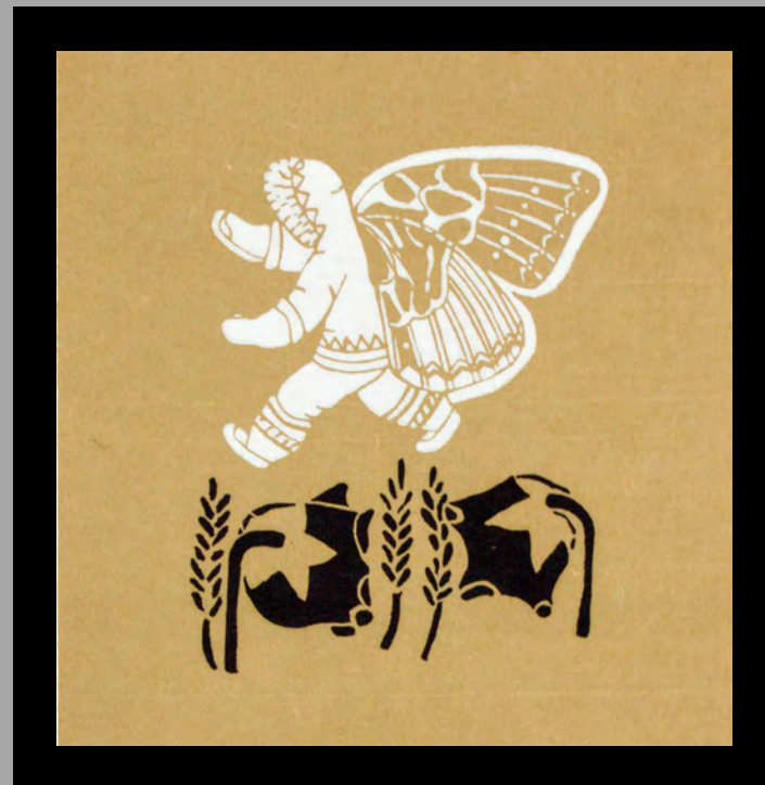
"Arctic Living I" 2018