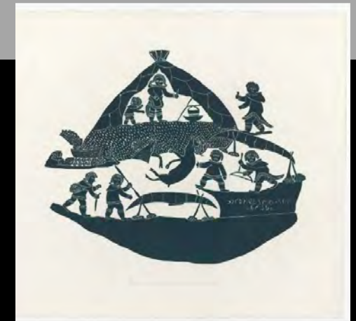
"Caribou Hunting Camp" n.d.