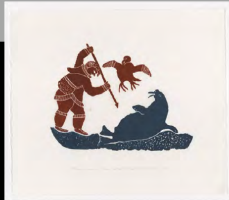
"Close to Famine, the Man Kills His Prey" n.d.