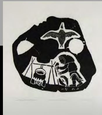
No title n.d.