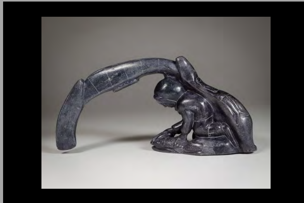
"Man Cleaning Fish Beneath Drying Kayak"

Levi is recognized as one of the most talented carvers of the eastern Arctic.