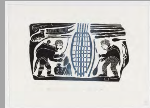
"A Man and His Wife are Making a Kayak" n.d.