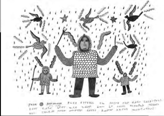
"Different Kinds of Animals" 1985