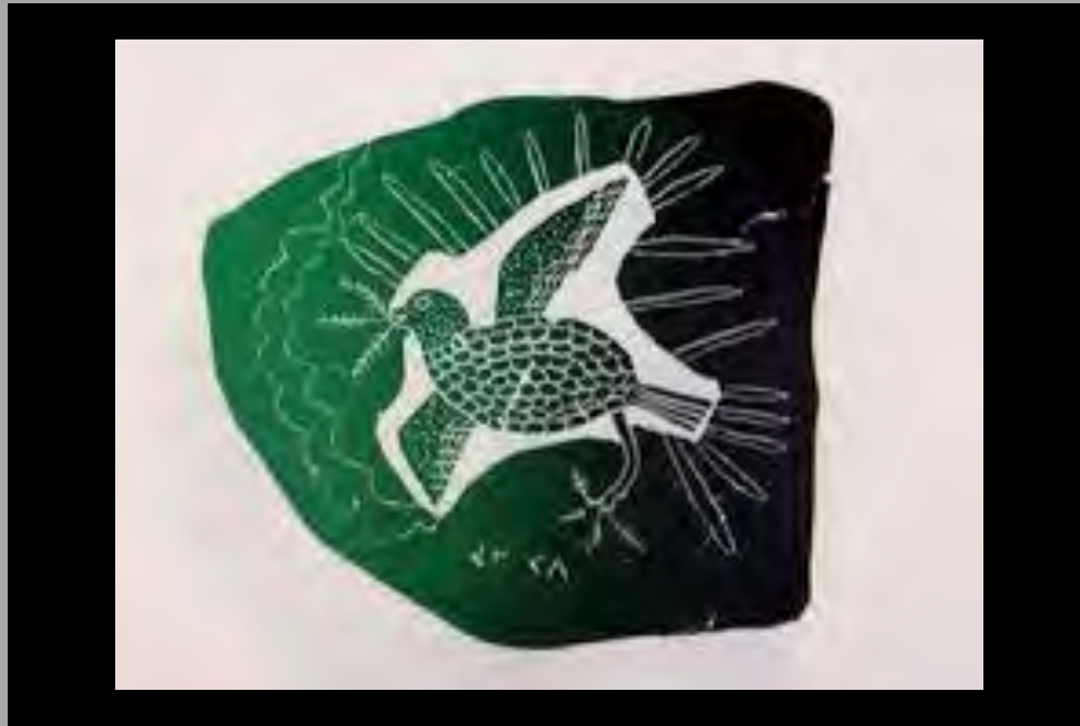
"Bird of Spring" n.d.

" He often depicted the wind in his drawings with wiggly lines; footprints would trail behind a figure to show how it got there". (Mitchell, 2004)