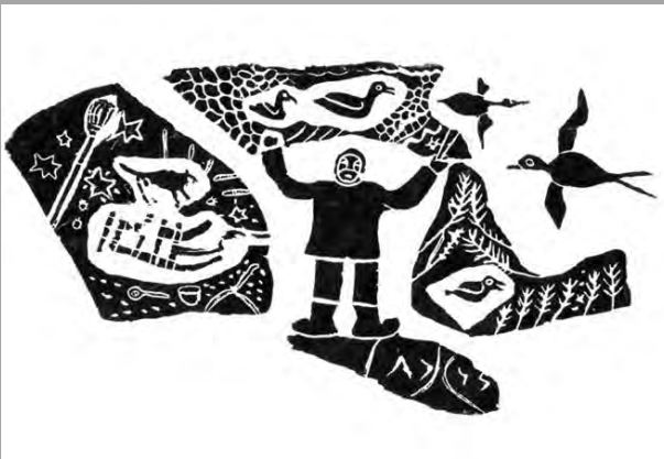
"Happily He Remembers All His Other Springtimes" 1987