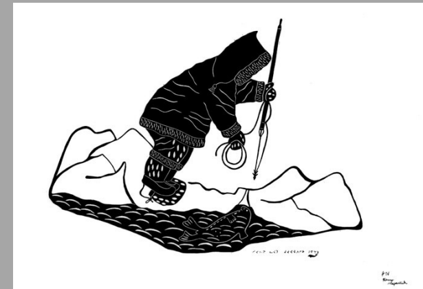
"Waiting at the Seal Hole" 1973