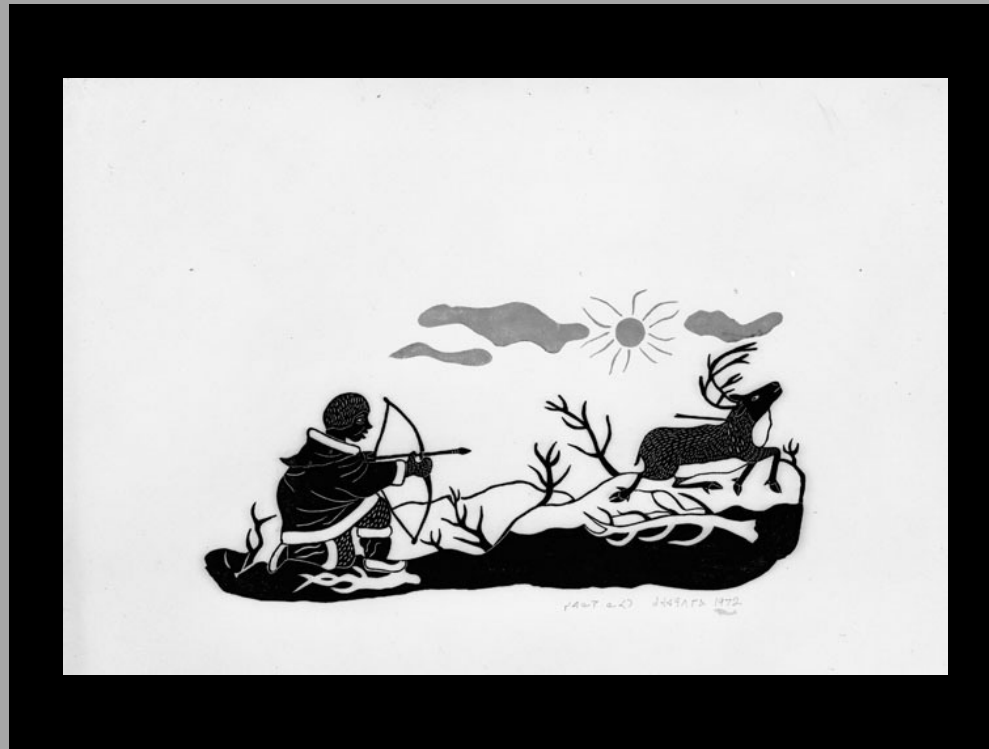
"The Old Way of Hunting Caribou"

Henry participated in snow sculpting competitions that were held in Quebec.