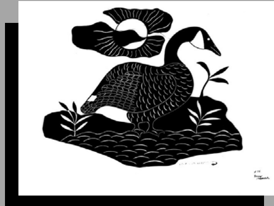
"The Geese Returning in the Spring" 1973