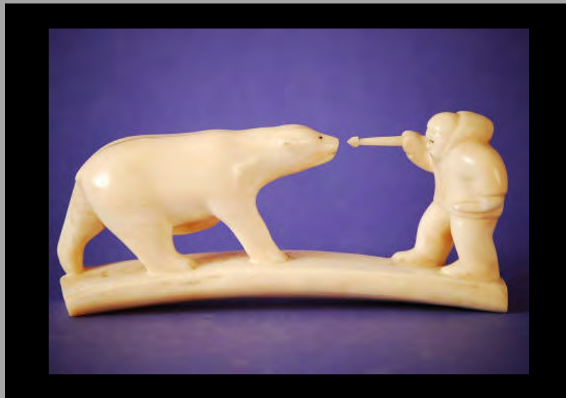
"Inuk and Bear"