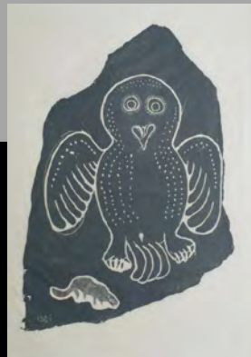
"Owl and Lemming" 1968