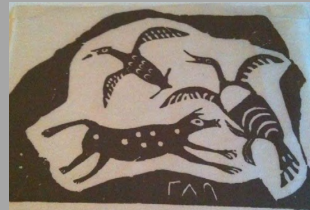
"Young Dog" n.d.