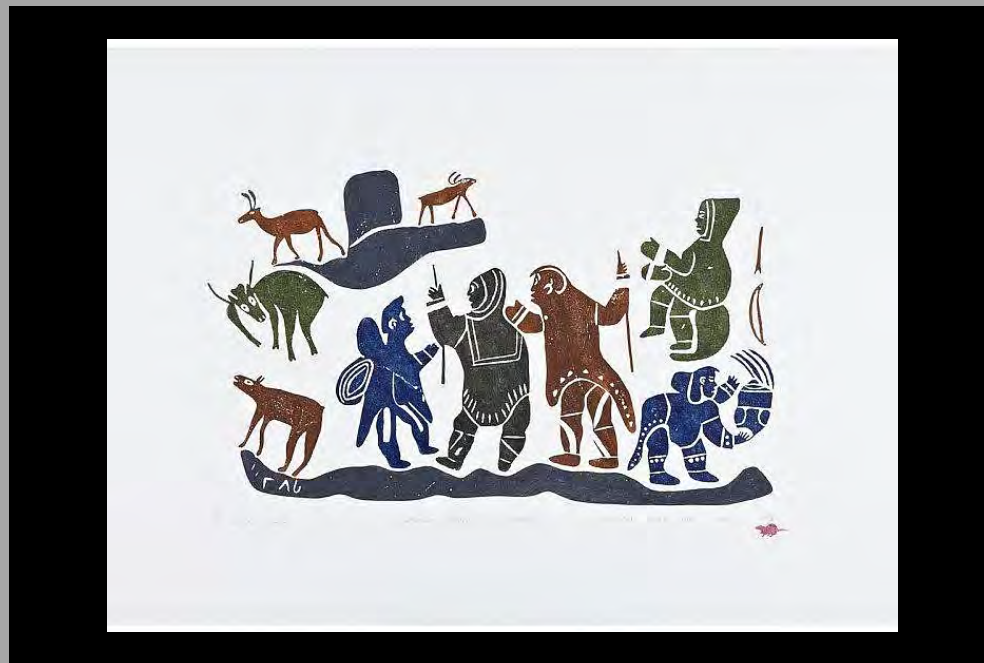
"Eskimos, While Eating a Meal, Saw Caribous Coming Near Them"