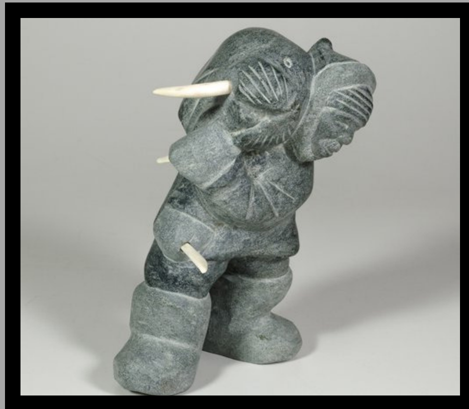
"Walrus hunter" 2009

He is known as one of Salluit's most gifted carvers.