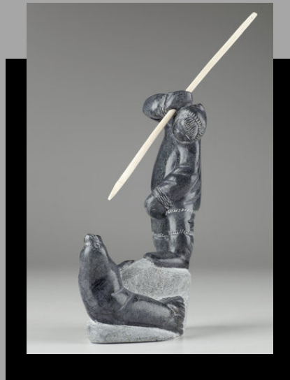
"Hunter and seal" n.d.