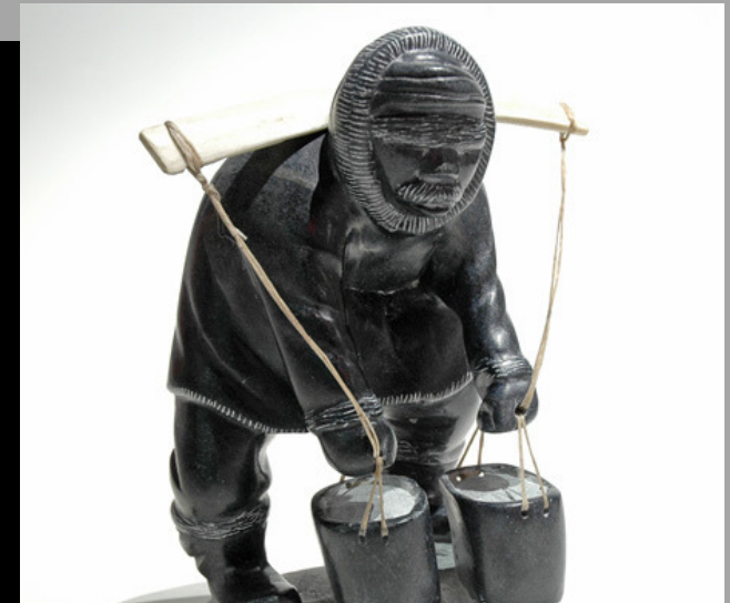
"Collecting water" n.d.