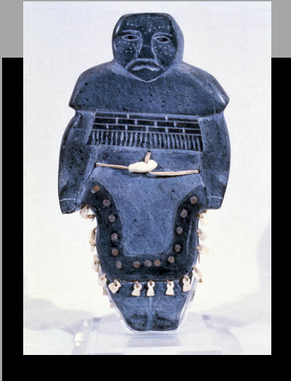
"Woman in traditional dress" 1977