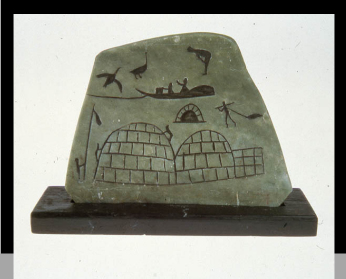
"Hunting scenes" 1955