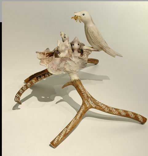
"Bird feeding young" n.d.