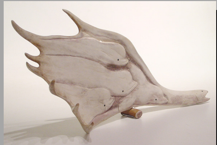
"Belugas and otters chasing a fish" n.d.