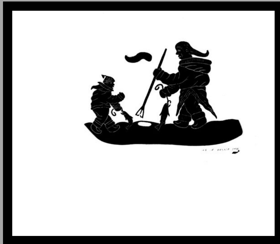
"Mother and son"

Winter Olympics in France where he demonstrated his skills in snow sculpture.