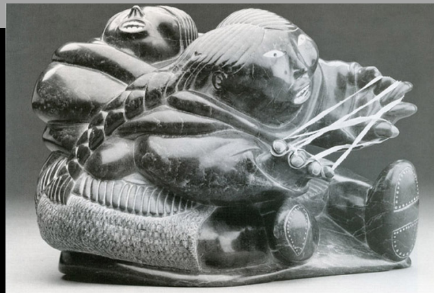
"Woman playing a string game" 1987