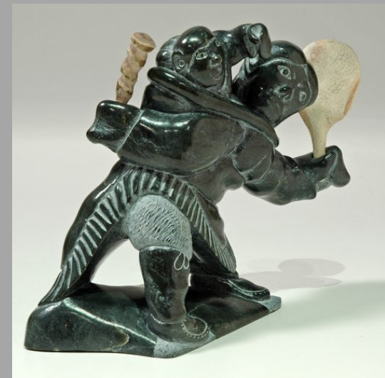
"Mother and child drum dancing" n.d