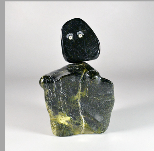
"Woman stretching skin" 1996