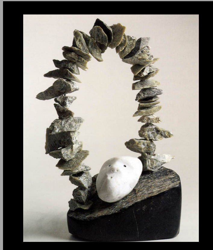
"Whistling at Northern lights" 1999-2000