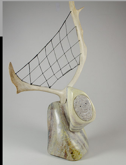
"Young fisherman anticipating a good catch of fish" n.d.