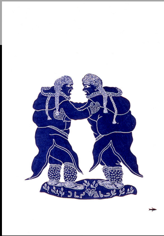
"Two women making throat music" 1975