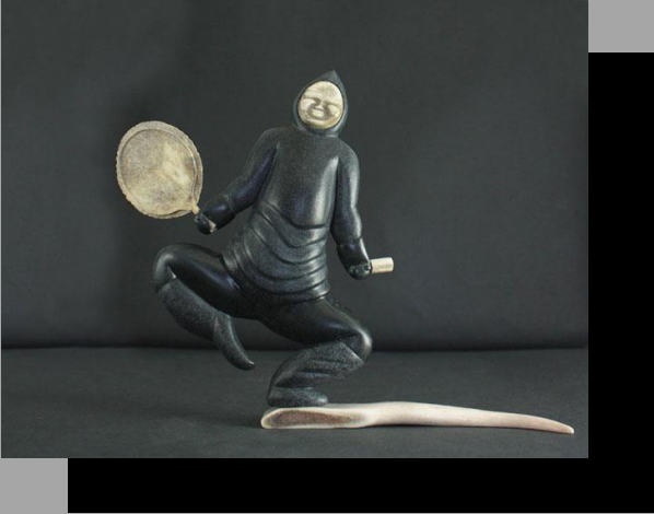
"Drum dancer" 2007