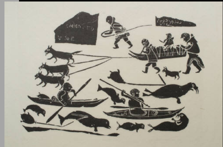
"Kayakers seal hunting" 1963