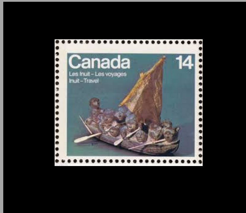
Stamp "migration" 1976

One of his "migration" carvings was made on a 14-cent Canadian stamp in 1976.