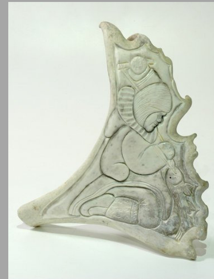
"Woman ice fishing" n.d.