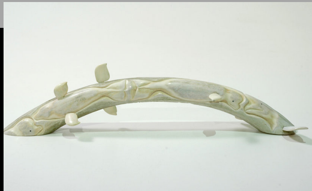
"Pod of beluga whales" n.d.