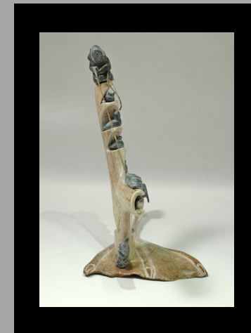
"Egg collecting" 1999