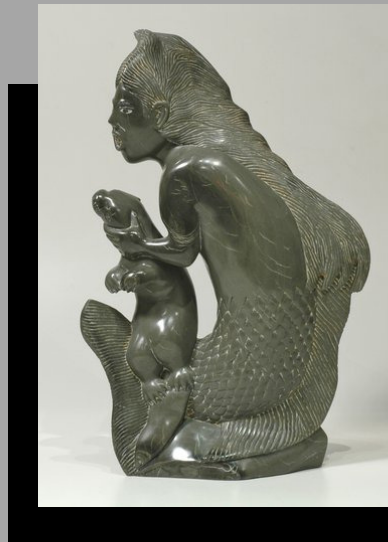
"Sedna with otter" n.d.