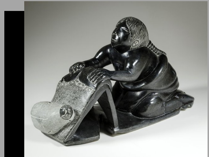
"Woman flensing hide" n.d.